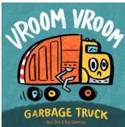
Vroom Vroom Garbage Truck by Asia Citro